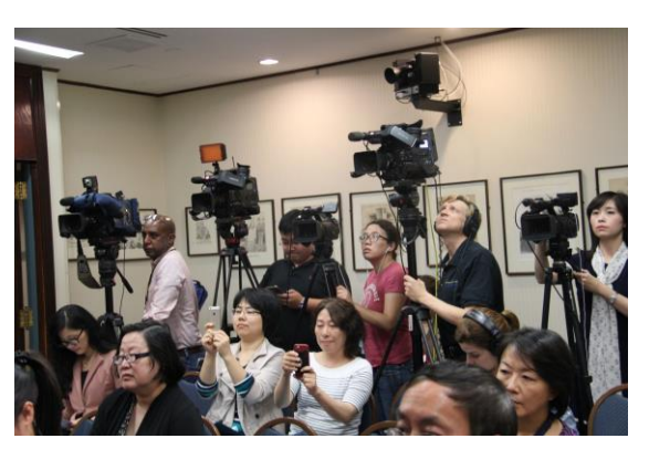
News Crew and Supporters